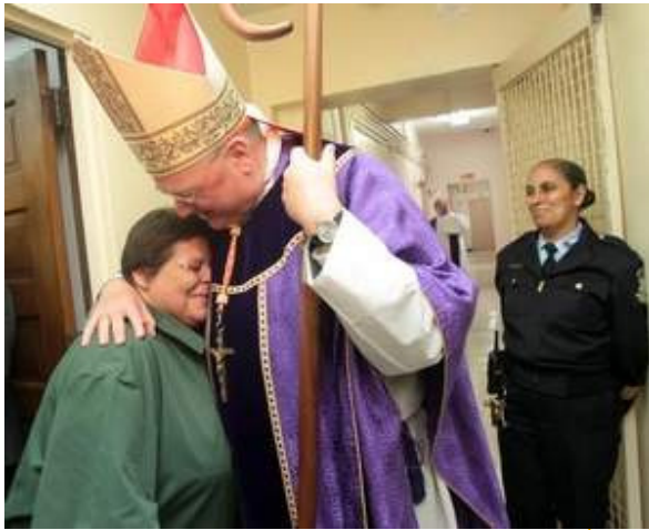
Purchase Image Zoom Cardinal Timothy Dolan greets women inmates after Mass at the Taconic Correctional Facility in Bedford Hills on Wednesday.